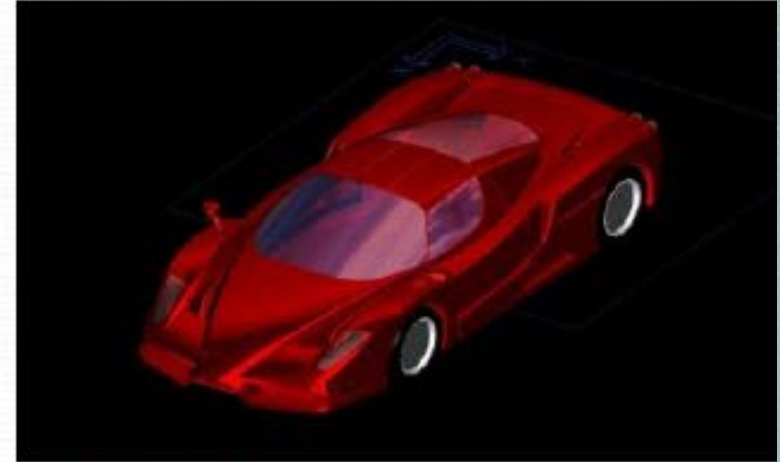
3D CAD MODEL